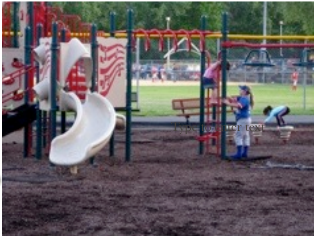
The Village's Park at Peck's Pond features a lighted walking path, ballfields, a roller rink and playground.